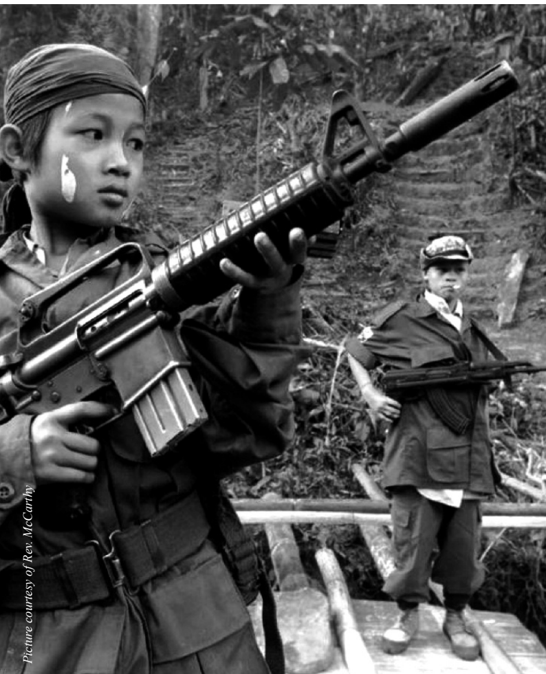
Gravissimam plagam: Thai children with Russian AK-47 and American M-16

Restoring peace means, in the first place, calling by their proper names acts of violence in all their forms. Murder must be called by its proper name: murder is murder; political or ideological motives do not change its nature. The massacre of men and women, whatever their race, age or position, must be called by its proper name.