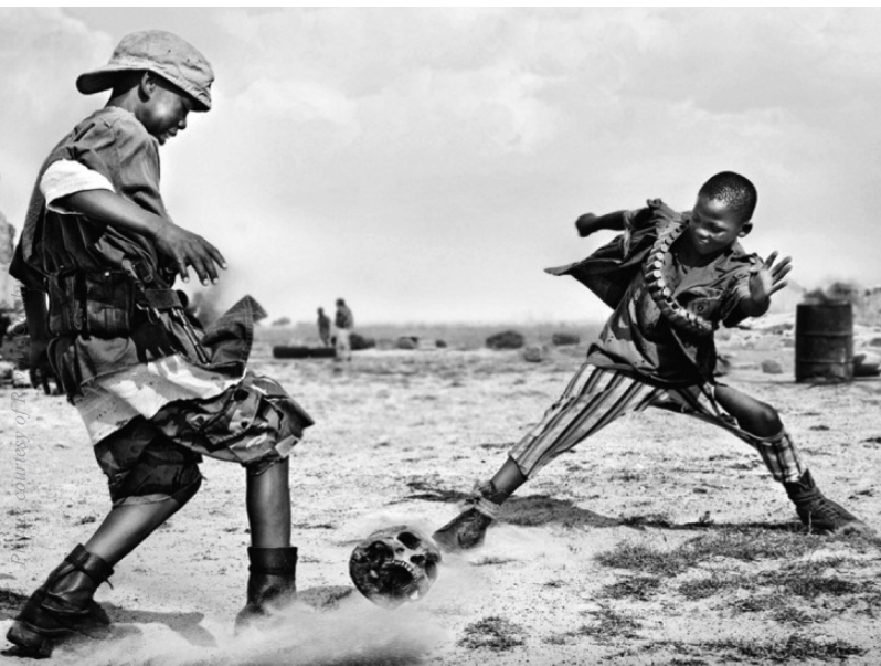
Behold what the First World arms merchants have wrought!

Hermann Göering, Nazi Reichsmarshall , was perhaps more clear-