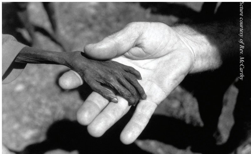
Gravissimam plagam: No words necessary, just raw evil.

Jean-Paul Sartre, the famous twentieth-century French philosopher and atheist, was speaking the truth when he bluntly told his audience, When the rich make war, the poor die. Jay Gould, the infamous late eighteenth-century American robber-baron, who made a fortune from the blood and agony of hundreds of thousands of other human beings, once remarked: I can hire half the poor to kill the other half. The poor, the anawim and especially their children, are always putty in the hands of the rich and powerful who pretty much do with them as