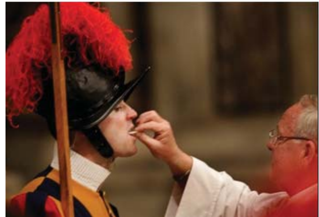
A Doublethink Photograph. Swiss Guard armed with a halberd receiving Holy Communion, the Lamb of God, at a Papal Mass.

However, doublethink, as a modus operandi of thought intrinsically knows no illogical limits. So, if doublethink is good for my goose, doublethink must be good for your gander. There is no basis other than doublethink itself for denying access to it as a way of conducting life and justifying life’s conduct. If you can have your Christian doublethink life, theology and morality, then I can have with equal validity my Christian doublethink life, theology and morality.