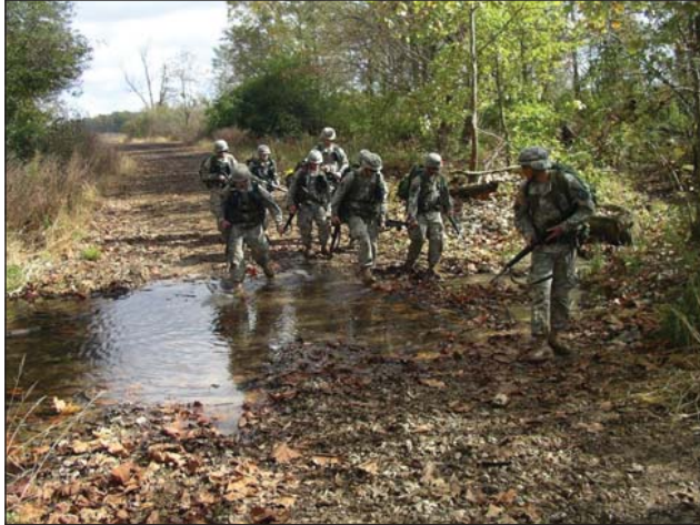
Welcome to the Fightin Irish Battalion God, Country, Notre Dame

of the Church. Second, because, historically, the Constantinian mother Church and her progeny, for over 1000 years before George Orwell and 1984, have been masters at creating, nurturing, and sustaining doublethink Orwellianisms to serve their interests. One prominent example: Justitia et Misericordia , “Justice and Mercy,” the motto of one of the most unjust and merciless of the