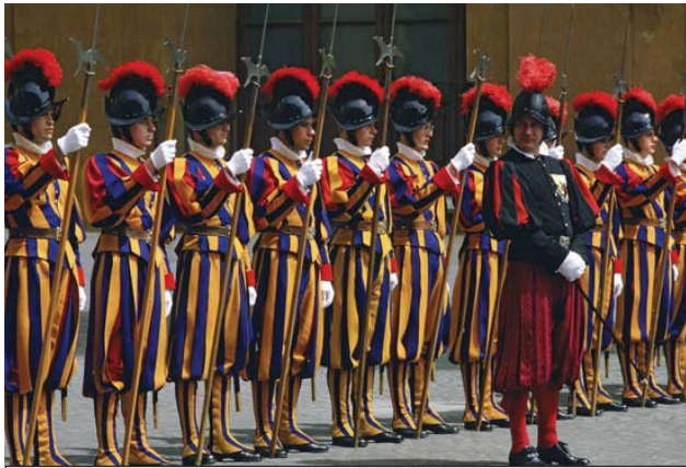
Swiss Guards in Formation Armed with Halberds. Today's Swiss Guard is not simply a tourist attraction but is a "lean, mean, fighting machine" (CNS). A papal Swiss Guard is expert in the modern technologies and ancient techniques for killing human beings. It is the longest continuing operating army in the world.

H oly Mother Church, that is, the institutional Constantinian Church, gave birth to the institution named the University of Notre Dame. It was in this mother's image that this Constantinian Catholic university was formed. She was Notre Dame's mother, and Notre