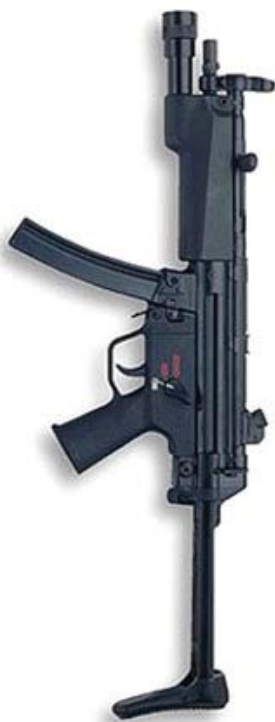
21 st Century Halberd. While they still wear armor and carry antique weapons, it’s not all medieval warfare for the Swiss Guards. They must master modern weaponry, such as this H&K submachine gun.

love, fear and freedom, domination and service, mercilessness and mercy, coercion and conversion the kingdoms of the world and the Kingdom of God, that is, what He taught by word and deed as the Way and Will of the Father of all .