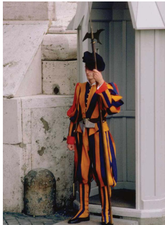
Swiss Guard Armed with a Halberd. One picture of a Swiss Guard armed with a halberd to protect the Vicar of Christ from the fate of Christ by means that Christ explicitly rejected, indeed to protect him from the imitation of Christ, overrides more than a million words of truthful proclamation—and will mar every one of those words.

Neither should the Bishop of South Bend-Fort Wayne be surprised when he and his predecessors and the Catholic Bishops of the U.S. and the world have validated and supported the Constantinian inscription "God, Country, Notre Dame" in one form or another, as well as, the utterly fraudulent "IN GLORY EVERLASTING" which accompanies it, for 1700 years. If so many other presidents, politicians, and military men, who have clearly