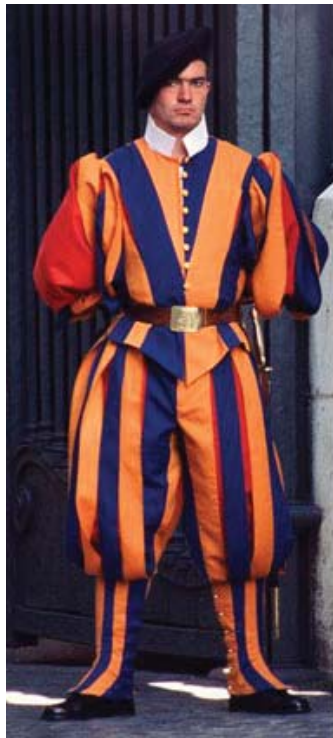
21 st Century Halberd. While they still wear armor and carry antique weapons, it's not all medieval warfare for the Swiss Guards. They must master modern weaponry, such as this H&K submachine gun.

The only solution to the Notre Dame-Bishop D'Arcy symbolic, but real conflict is the previously noted Church-wide hierarchical metanoia : A Christ-like metanoia , by Notre Dame, the Bishop of South Bend, the USCCB and the Vatican, which rejects publicly and permanently the Constantinian-Orwellian doublespeak alterations of the teachings of Jesus that have been introduced into the Church is the only solution. Such a metanoia would return the Church including the USCCB and Notre Dame to teaching and acting in conformity with a universal non-doublethink interpretation of what Jesus taught by word and deed concerning violence and nonviolence, enmity and