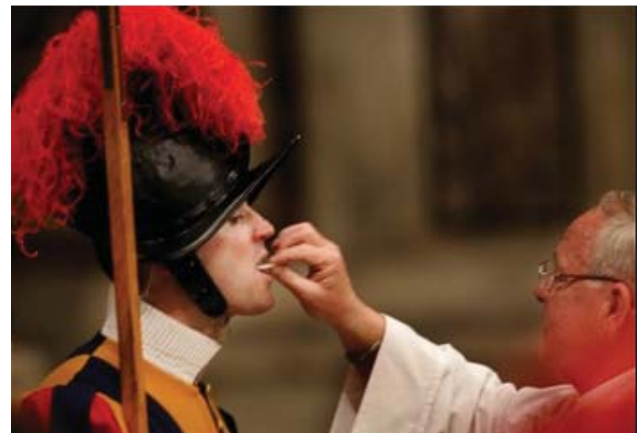
Swiss Guard armed with a halberd receiving Holy Communion, the Lamb of God, at a Papal Mass.

All this is and more along these lines is directed at Islam, not a word in the lecture about the colossal and far-reaching betrayal of reason, the Logos (Word), by his own Constantinian-