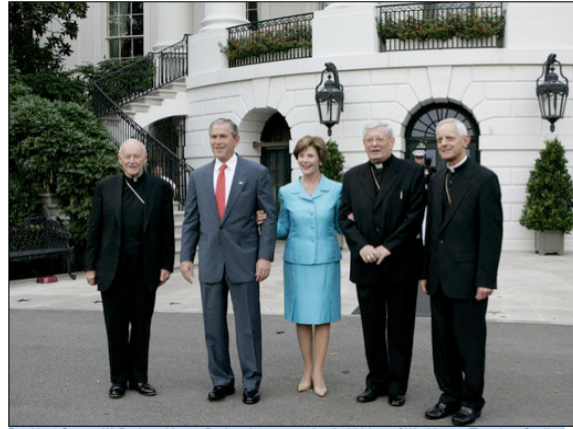
George Bush, Laura Bush, Cardinal McCarrick, Archbishops Sambis and Wuerl