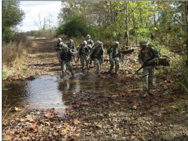
Welcome to the Fightin Irish Battalion God, Country, Notre Dame

of the Church. Second, because, historically, the Constantinian mother Church and her progeny, for over 1000 years before George Orwell and 1984, have been masters at creating, nurturing, and sustaining doublethink Orwellianisms to serve their interests. One prominent example: Justitia et Misericordia , “Justice and Mercy,” the motto of one of the most unjust and merciless of the