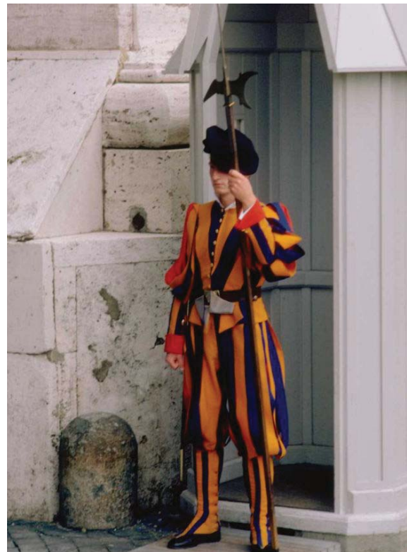
Swiss Guard Armed with a Halberd. One picture of a Swiss Guard armed with a halberd to protect the Vicar of Christ from the fate of Christ by means that Christ explicitly rejected, indeed to protect him from the imitation of Christ, overrides more than a million words of truthful proclamation—and will mar every one of those words.

Neither should the Bishop of South Bend-Fort Wayne be surprised when he and his predecessors and the Catholic Bishops of the U.S. and the world have validated and supported the Constantinian inscription "God, Country, Notre Dame" in one form or another, as well as, the utterly fraudulent "IN GLORY EVERLASTING" which accompanies it, for 1700 years. If so many other presidents, politicians, and military men, who have clearly