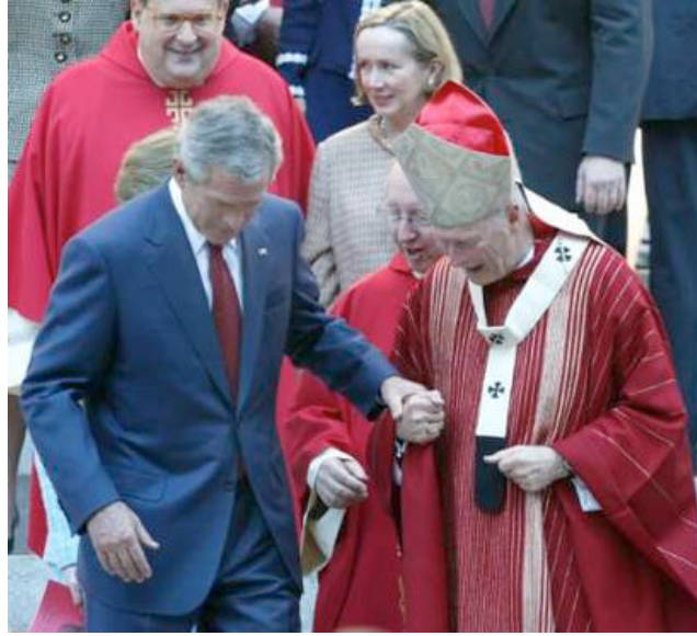
CARDINAL MCCARRICK OF DC JOVIALY HELPING GEORGE BUSH DOWN SOME STEPS.

I conclude with the following photograph of President George W. Bush, taken years after it was known publicly that not one of the standards of Natural Law Catholic Just War Theory, ad bellum and in bello , had been met or was being met and that therefore the killing of hundreds of thousands of human beings in Iraq was objectively murder—an always intrinsically grave evil which, in Catholic moral theology, is never morally permissible, under any set of circumstances, or for any reason.