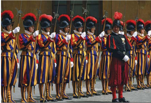
Swiss Guards in Formation Armed with Halberds. Today's Swiss Guard is not simply a tourist attraction but is a "lean, mean, fighting machine" (CNS). A papal Swiss Guard is expert in the modern technologies and ancient techniques for killing human beings. It is the longest continuing operating army in the world.

H oly Mother Church, that is, the institutional Constantinian Church, gave birth to the institution named the University of Notre Dame. It was in this mother's image that this Constantinian Catholic university was formed. She was Notre Dame's mother, and Notre